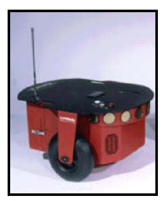
Figure 1. The holonomic robot Pioneer 2DX