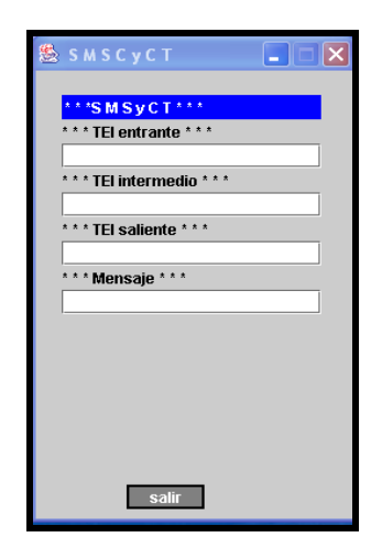
Figure 4. The SMS/Phone Center interface.

The SimRobot interface is a modified version of JMR, where we add the GSM modem (M2), which is attached to the robot, and the VeriCommand module (Fig. 5). The additional modules are employed to monitor and verify commands, communication and data transmission.